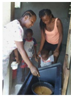
Baking cake on solar