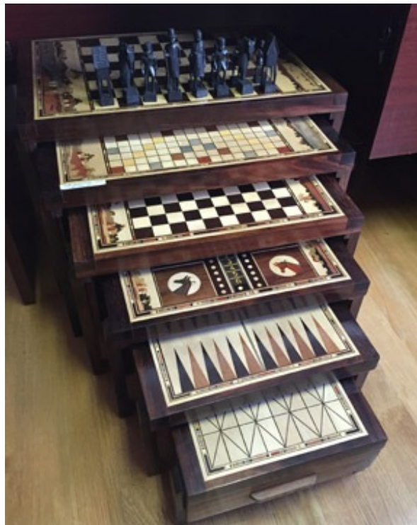
Game tables from wood and stone