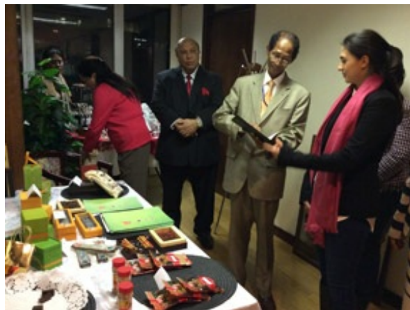
Viewing Malagasy products