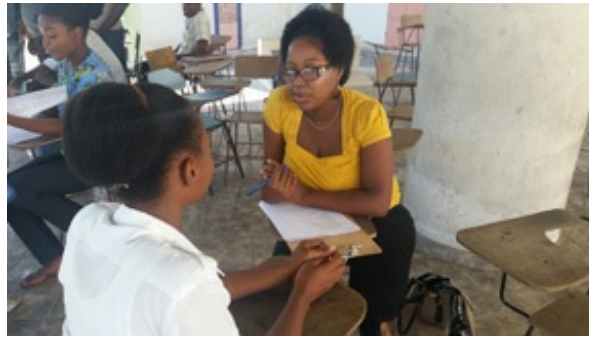
Interview on Stove Use