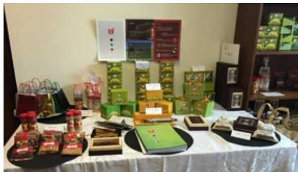
Tea and spices