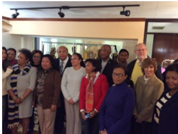
Some of the vendors, staff and guests