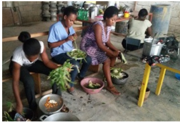
Preparing food for Controlled Cooking Test