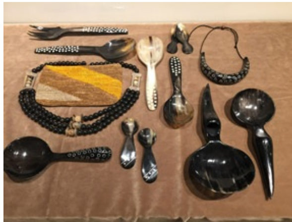
Jewelry & tableware from Zebu horn