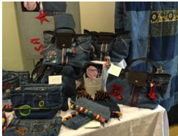
Blue jean fashions